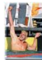
Rowdy Gaines Three-time Olympic Gold Medalist 1984 Olympic Games in Los Angeles